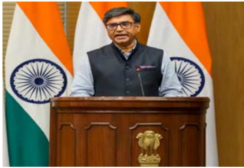
the foreign secretary on the MEA website.

"A career diplomat from the 1989 batch of the Indian Foreign Service, Ambassador Misri has served in various capacities at the Ministry of External Affairs, in the Prime Minister's Office in New Delhi and in various Indian Missions abroad in Europe, Africa, Asia and North America," according to a profile of