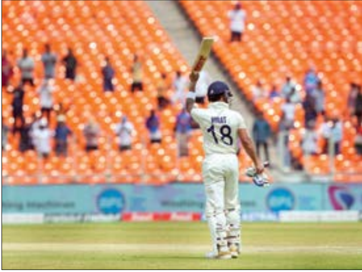
Indian in that position.

Under his leadership, India won 40 of 68 Tests, making him the most successful for his country and fourth most successful overall, behind South African Graeme Smith, Ricky Ponting and Steve Waugh. He also logged 20 hundreds as captain, making it the highest by an